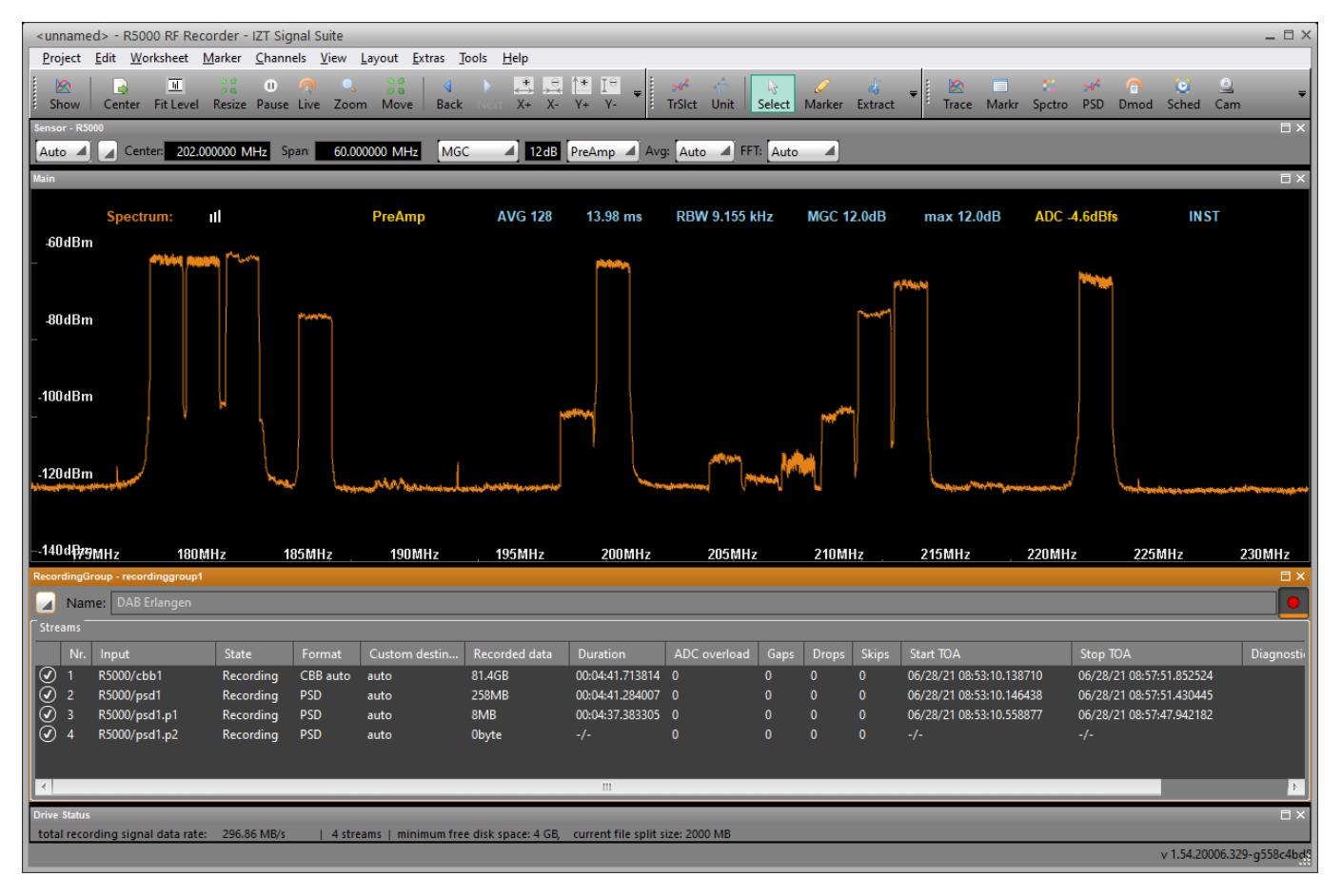
Figure 7: IZT Signal Suite IQ wideband recording with 60 MHz

The trigger event can be defined by power limits exceeding spectrum masks, captured reference traces with adjustable offset or manually by pressing the recording button or by an external trigger pulse. Captured signal events are automatically stored in subfolders with trigger log, PSD and CBB I/Q files.