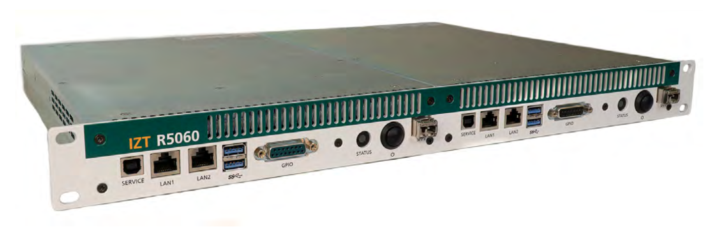
Figure 4: Two receivers installed in rack mount kit R5060-MNT with 1U form factor

All internal clocks are derived from a single reference oscillator, the built-in high-stability oscillator, which itself can be sychronized to an external source, the built-in GNSS receiver module or slaved to another IZT R5060 receiver via PTP. Once the LAN connection is removed, their internal reference oscillators will maintain highest frequency accuracy to ensure minimum drift of the time bases between multiple receivers.