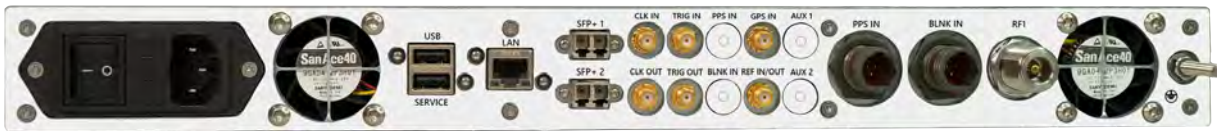
Figure 5: IZT R5020 REAR PANEL

All electrical interfaces of the IZT R5020 are located on the rear panel. Interfaces which are reserved for future use are not populated and covered with blind panels.