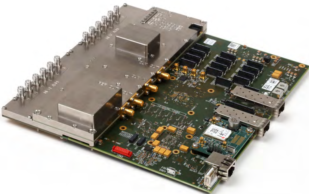
Figure 1: IZT R5020 DSP SECTION

The IZT R5020 can be used with the IZT Signal Suite GUI applications, through an IZT SDK or with 3rd party software.