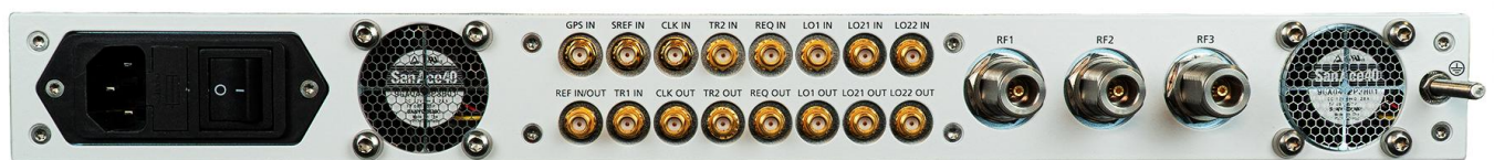
Figure 2: Interfaces of the IZT R5010 Receiver