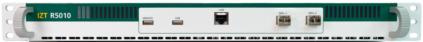
Figure 1: IZT R5010 Receiver