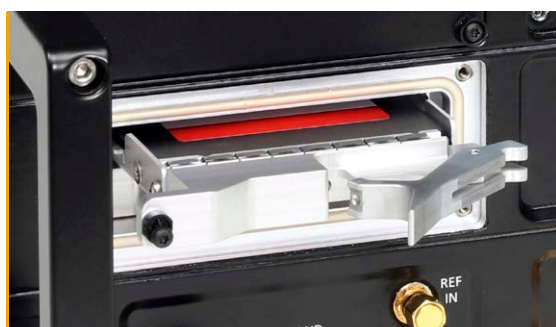
FIGURE 4: ONE OF FOUR 2.5" TRAYS OF THE DATA STORAGE

All interfaces of the IZT R3302 are fitting the IP protection class IP54. For making sure that the interfaces are perfectly fitting to your needs the removable cover of the sensor controller interface ports allows integration of individual hardware. The connectors at the removable cover can be customized on user request.