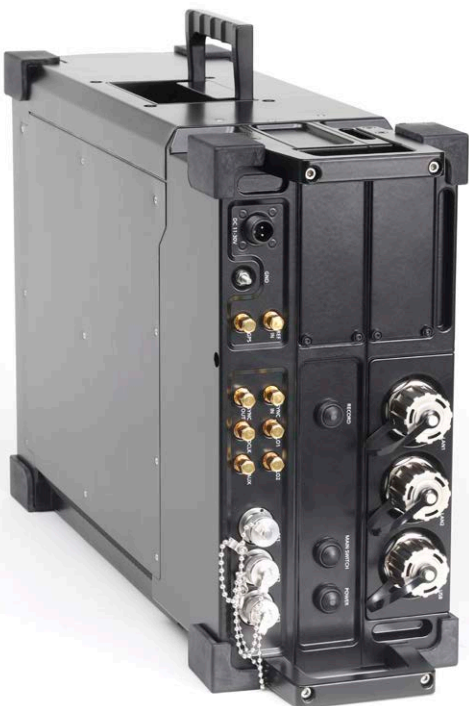
FIGURE 1: FOLDABLE GRIP FOR EASY CARRYING

The system is designed to produce good signal quality under challenging dynamic range conditions and has successfully passed many rigorous technical evaluations.