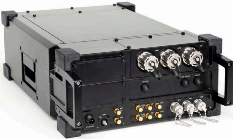
FIGURE 3: IZT R3302 RUGGED AND PORTABLE MONITORING RECEIVER AND RF RECORDER