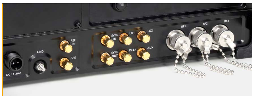
FIGURE 5: ALL INTERFACES ARE FITTING THE IP PROTECTION CLASS IP54