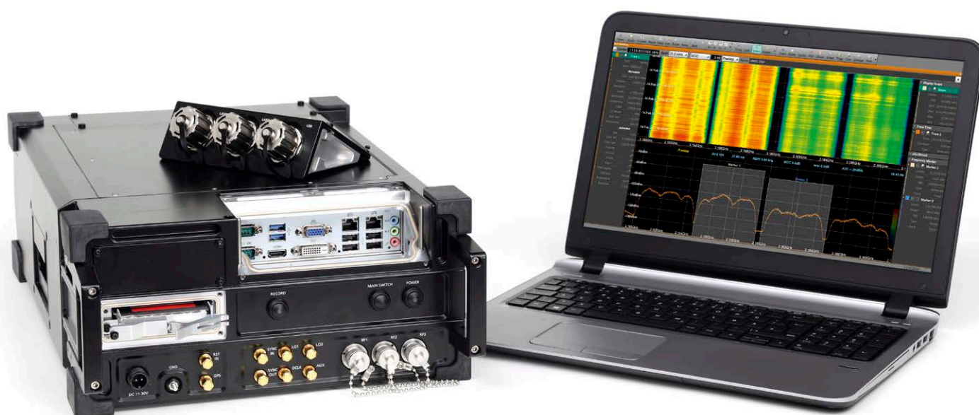
FIGURE 2: IZT R3302 WITH OPEN INTERFACES AND EXTERNAL SENSOR CONTROLLER

Monitoring and configuration of the unit can be carried out remotely with Windows Remote Desktop (RDP) – either via 1 Gbit Ethernet interface from an externally connected PC or Notebook and optionally also via Cellular modem or short range Wi-Fi interface from a Notebook or Tablet PC.