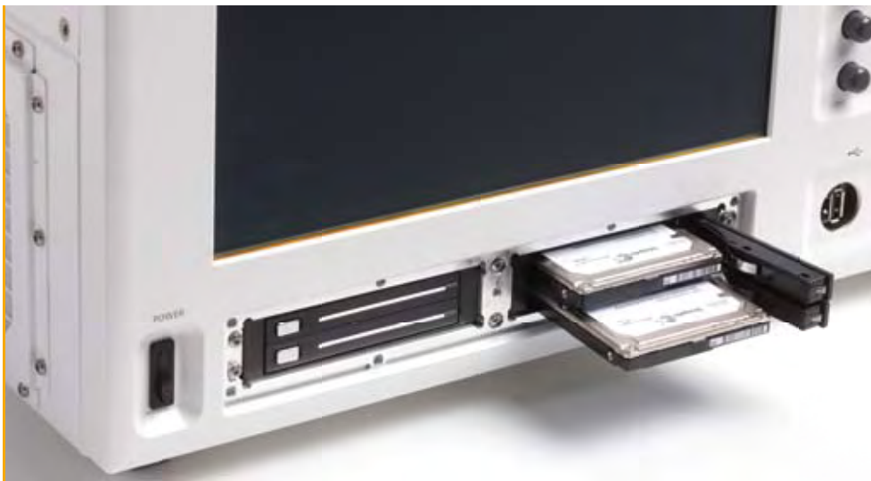
Easy RAID storage swapping